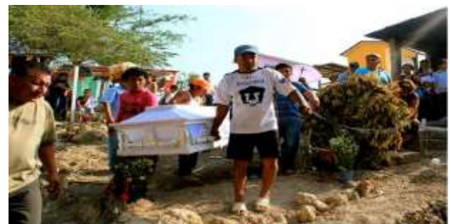
Figure 8 Burial in the ejidal pantheon

The long and long-suffering cries accompany the last journey of the coffin. This is done walking due to the type of terrain on which the pantheon lies (a plateau with slopes). In an open space, where disorder and diversity prevail, it is easy to lose one's composure, the relatives cry, scream, other graves even serve as a seat while waiting for the placement of the coffin in the grave. It is common that while the coffin is lowered, handfuls of earth or flowers are thrown at it. Once the burial is finished, the family members place all the flowers received marking the grave, making use of plastic or metal jars (see Figures 8 and 9).