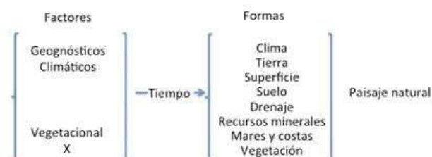
Figure 1 Krebs natural landscape

This one experiences a second moment when the subject carries out the cultural impression of him (Krebs in Sauer, 2006); the man begins the registration of him on said geographical territory and the landscape changes from natural to cultural. Cultural landscape is considered any space in which subjects, other living beings and all those elements that make up the environment converge and coexist (see figure 2).