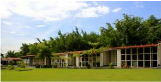
Figure 7 Overview of the mausoleum

Little by little we are entering the changes that globalization, that which has led to sharing organizational models, is generating in some of the spaces in which death begins to be experienced in different ways. The following photographs are testimony to the way both cemeteries are organized. While on the one hand the public space offers cheaper costs to bury the deceased, the costs in the private mausoleum are even doubled.