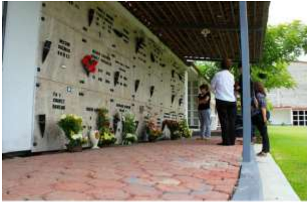
Figure 9 Crematorium

Figures 10, 11 y 12. Entierro tradicional en el panteón ejidal.