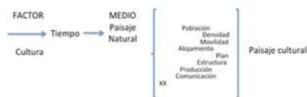
Figure 2 Krebs Cultural Landscape

The International Council on Monuments and Sites (ICOMOS) observes the existence of two types of cultural landscape: the clearly defined landscape (PCD) and the organically evolved landscape (PEO). The PCD is created and designed intentionally by the human being, it is about landscaped landscapes and parks, built for aesthetic reasons. The PEO is born from an initial imperative of a social, economic, administrative or religious nature, it evolves in response to the adaptation to its natural environment. Three types emerge from this type of landscape (see figure 3). The vestige landscape (PV), the active landscape (PA) and the associative cultural landscape (PCA) are PEO (see table 1).