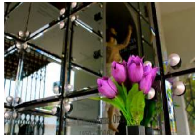
Figure 11 Detail of niche in the mausoleum

In the mausoleum this does not happen. Niches and tombs look the same, the only permission granted to the debtor is to place a plastic flower or a small toy, if so chosen (Figure 11).