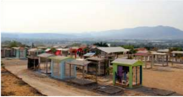
Figure 6 Panoramic of the ejidal pantheon