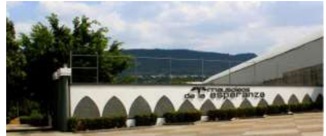
Figure 4 Access to the Mausoleum

While on the one hand we have an ejidal pantheon located on an irregular terrain with little planning, and dirt walkways (see Figure 4), in contrast, the Mausoleum is seen as a strictly planned place, with a garden design, everything is perfect, balanced: lines, strokes, architecture (see figure 5).