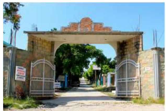
Figure 5 Access to the Ejidal Pantheon of Terán

Once inside, it is possible to observe how the relatives try to provide their own identity to each of the tombs, depending on the freedom that each of the spaces offers them. For example, in the ejidal pantheon, it is possible to find a diversity of designs, sizes, colors, shapes.