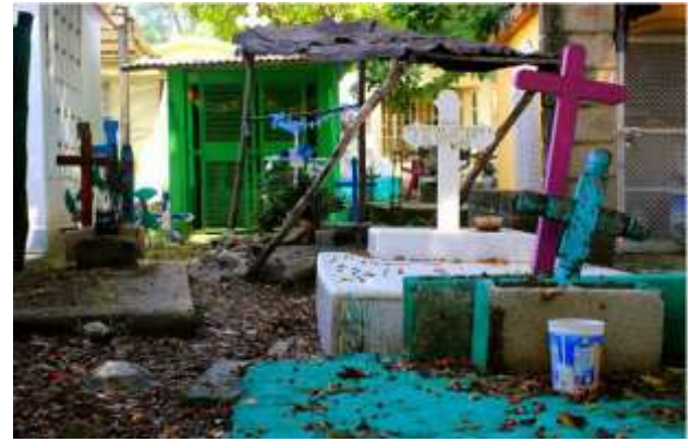
Figure 10 Graves

The mausoleum represents what Martín Barbero calls the bourgeoisie, while the ejidal pantheon is the town itself (1981). A space for any inhabitant. For this reason it is easy to notice the mark, that sign that the relatives seek to leave in the grave of their dead, throwing a hand of colorful paint, photographs, flower garlands, everything that can be placed and that cannot be easily stolen. (Figure 10).